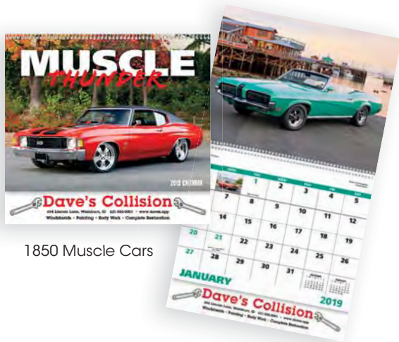
1850 Muscle Cars