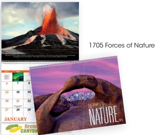
1705 Forces of Nature