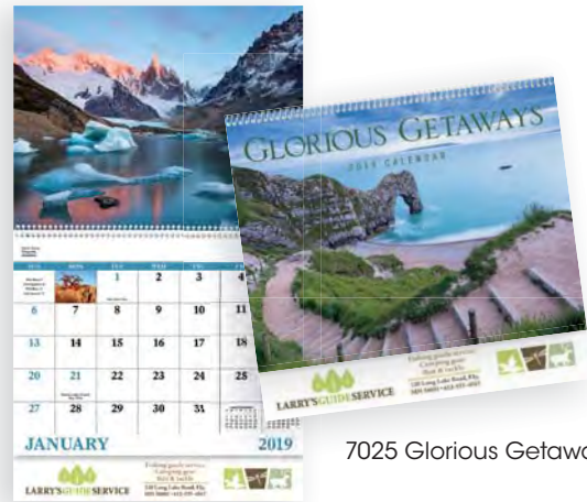
7025 Glorious Getaways