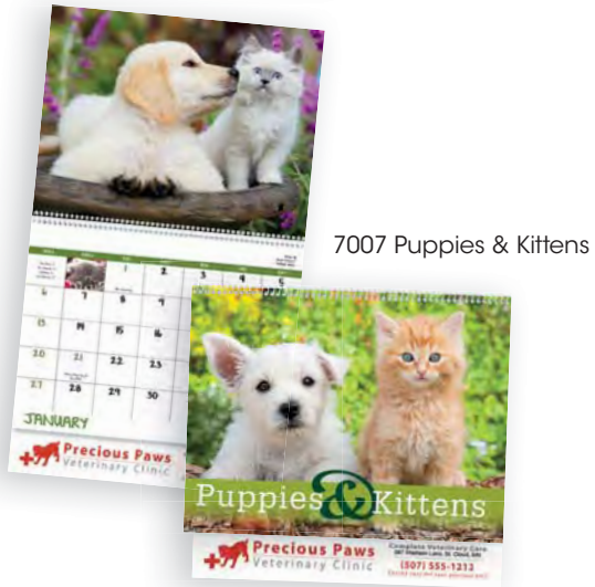
7007 Puppies & Kittens